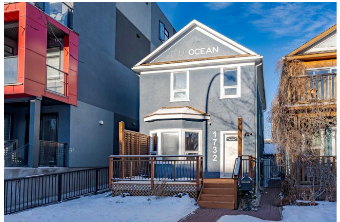
1732 11 Ave SW, Calgary, AB

Basement (Below Grade) Exterior Area 519.50 sq ft Interior Area 535.57 sq ft Excluded Area 50.03 sq ft